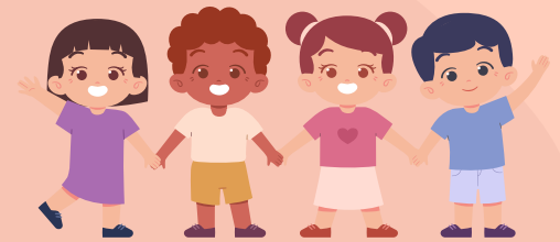
Childhood Vaccines/ Development

Call us at 519-582-2323 x 282 Or Sign-up Online