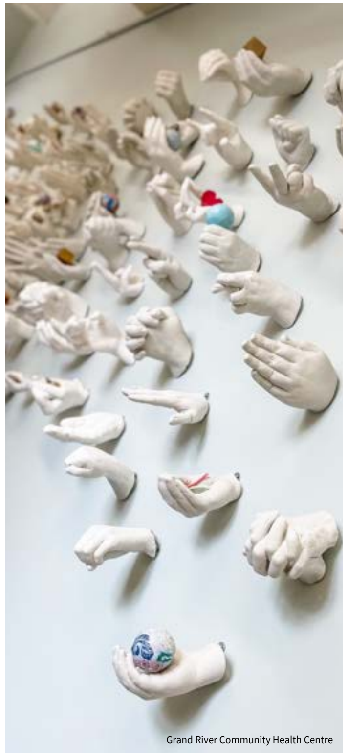
Grand River Community Health Centre